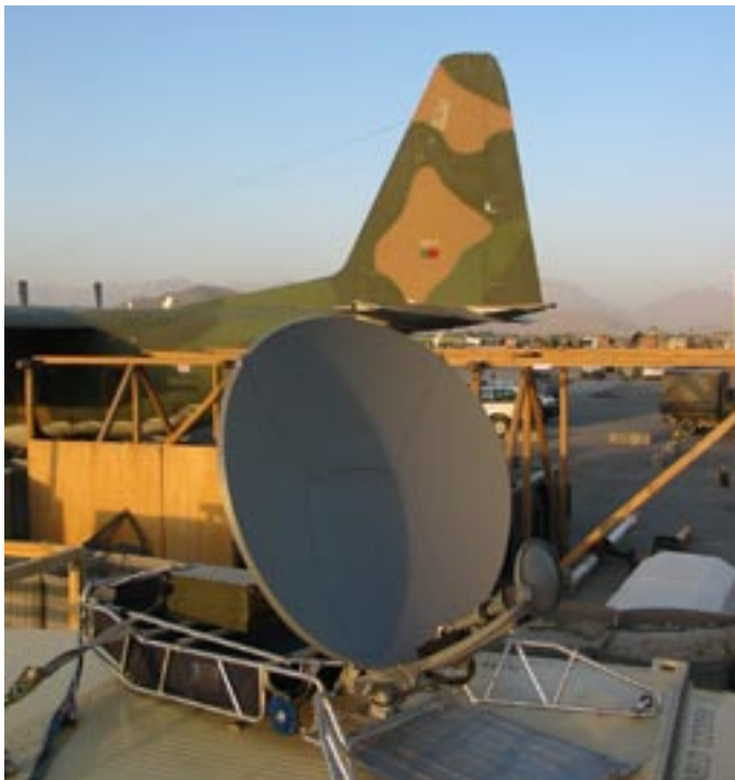
FA150X Mil Fly-Away. Here seen using an inclined orbit X-band satellite to provide out of theater connectivity.