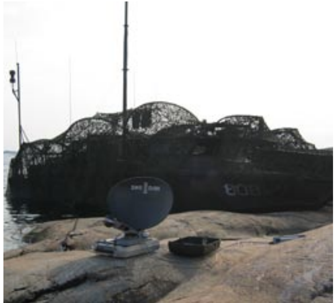
Gothenburg archipelago, Sweden, IPT Mil Suitcase. By providing a broadband IP link, the IPT Mil Suitcase brings email, LAN access and IP telephony to tactical units.

SWE-DISH is a global company with offices in Stockholm, London, Reston, VA (Washington DC) and Hong Kong. We also have sales and service support provided by local representatives and agents in most regions of the world.