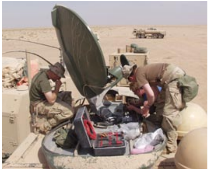
Central Iraq, SWE-DISH service technicians do a "500 km" check-up and change a wave guide on a DA150K Mil Drive-Away. The Drive-Away was used for command and control by the US Army Assault Command post during Operation Iraqi Freedom

We believe that the user's mission is critical. We are proud of our users and we show our dedication to them through our service and support.